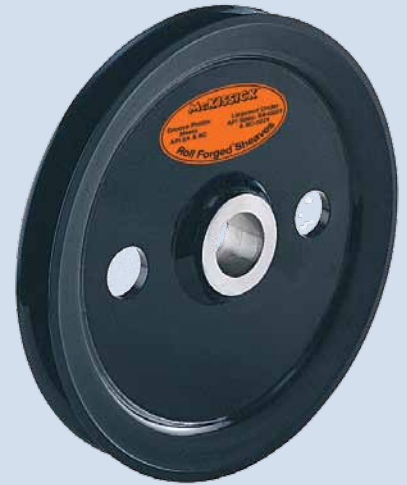
TYPICAL API SHEAVE RIM PROFILE